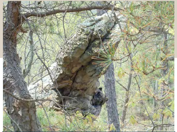
Pulpit Rock, Michaux State Forest

The Tuckahoe Tract will be acquired by the DCNR Bureau of Forestry and will be open for recreation.