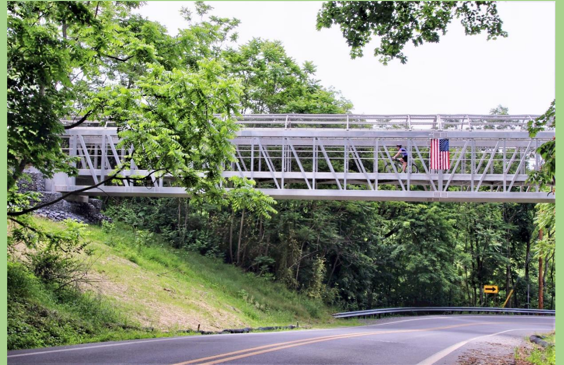
BIG SPRING ROAD BRIDGE