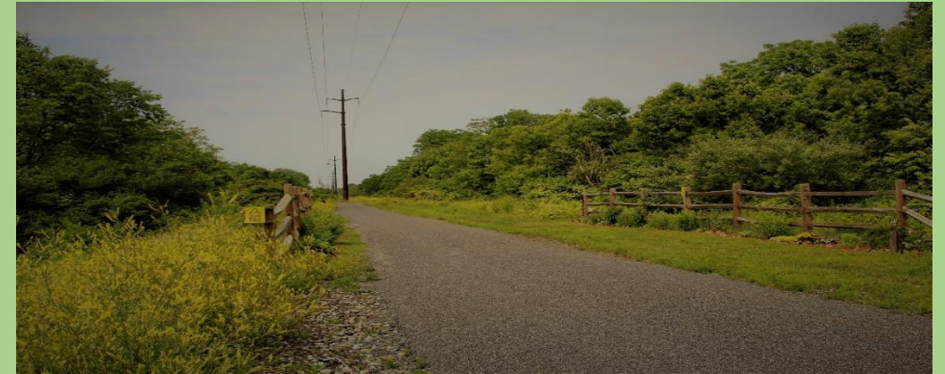
Alexander Spring Creek Bridge