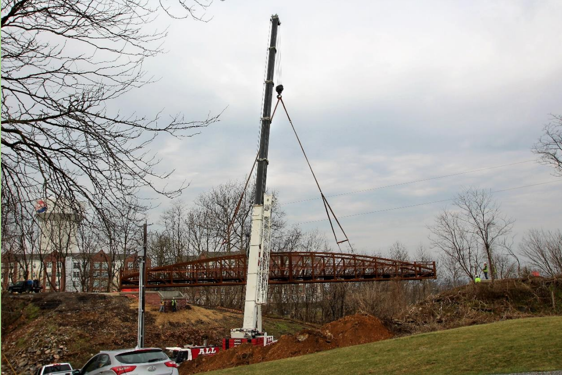
FOGELSANGER ROAD BRIDGE